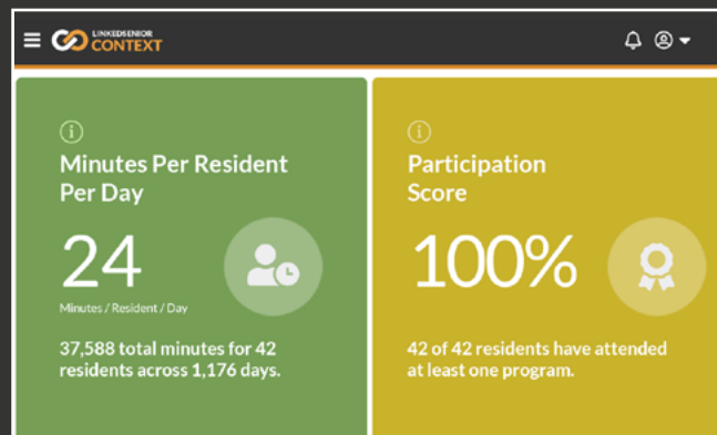
Comprehensive enterprise reporting and data analytics dashboard